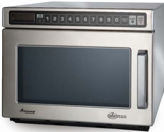
Model HDC212 shown